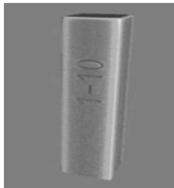
3D / Top View