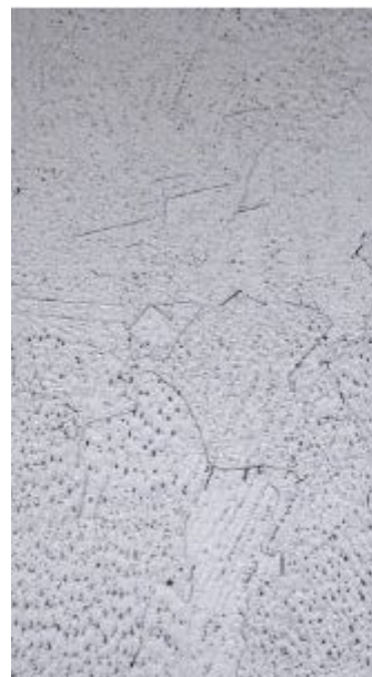
HT 100x Magnification