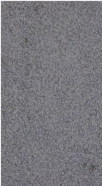
As-printed XY 100x Magnification