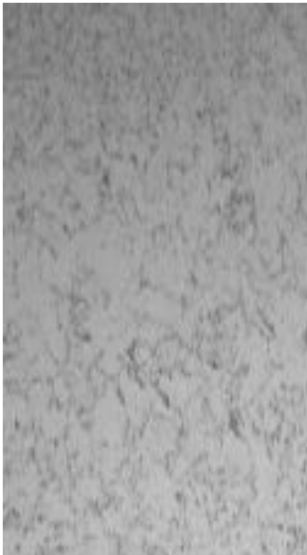
As-printed XY 100x Magnification