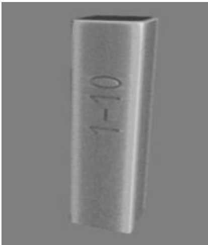
3D / Top View